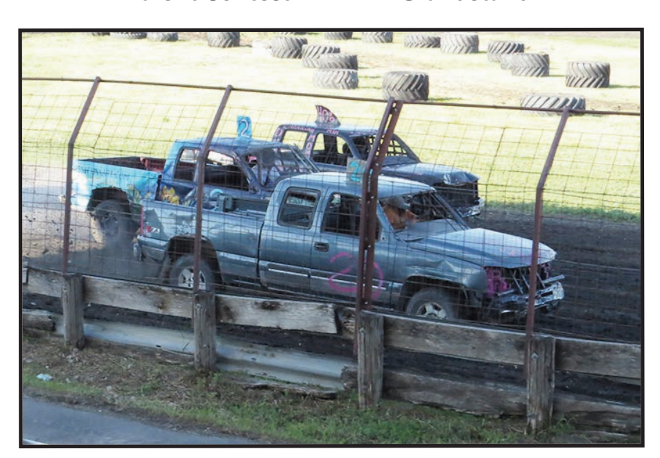
Saturday, July 19 and Sunday, July 20 6:00 p.m. each night

Baja Racing ~ Grandstand Tickets: Ages 13 and up • $10 Ages 6 - 12 • $5 5 and under • FREE