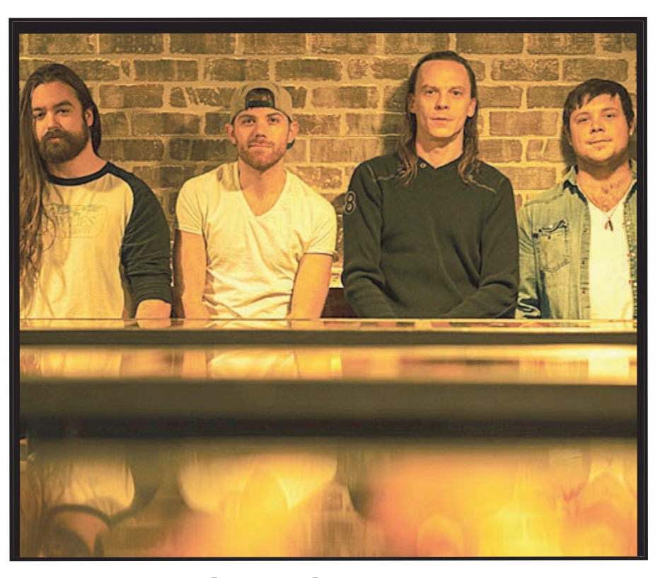
Friday, July 18 • 9:00 32 Below ~ FREE • Grandstand