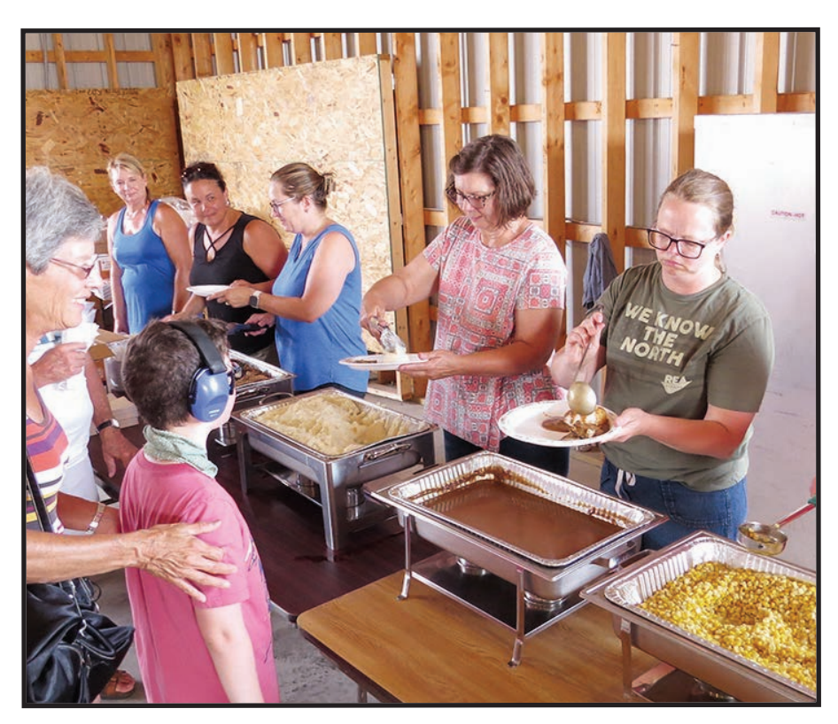
Wednesday, July 16 • 6:00 p.m. Farm to Plate Meal • SWCD Building