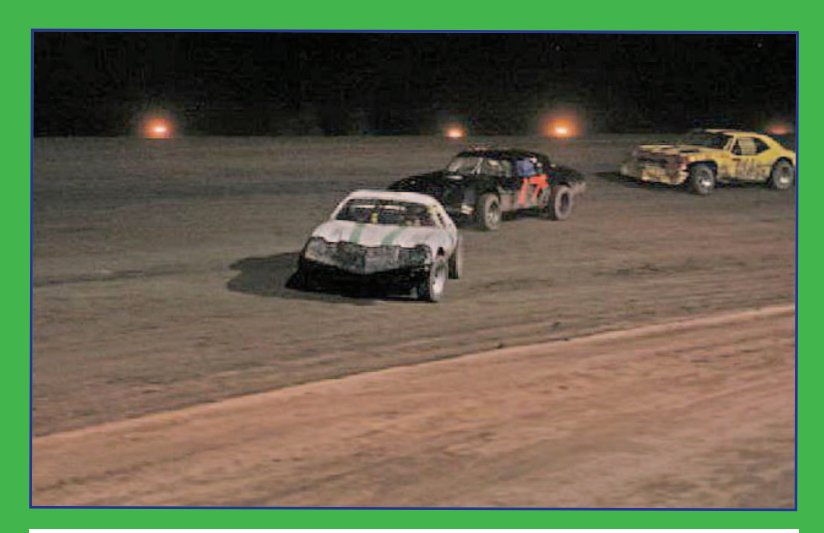
Saturday, July 13 • 7:00 p.m. Baja Racing