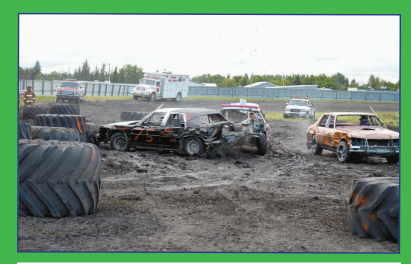
Sunday, July 14 • 6:00 p.m. Demo Derby & Little Tykes Demo