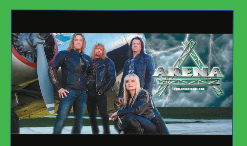
Saturday, July 13 • 9:00 p.m. Party in the dirt with rock band, ARENA