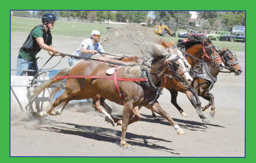
Friday, July 12 • 7:00 p.m. Chariot Racing